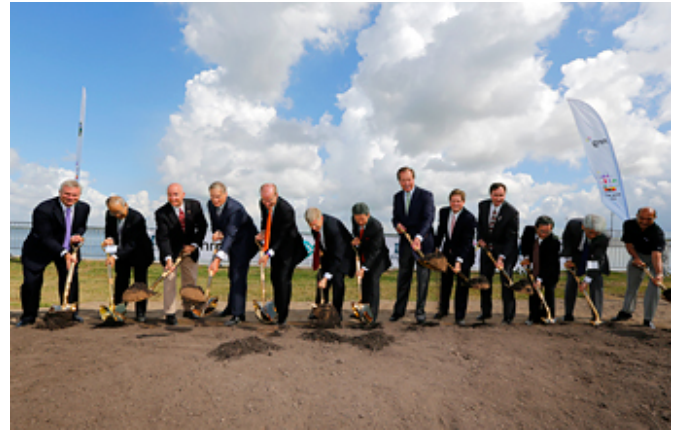
(picture2: a look of groundbreaking ceremony)