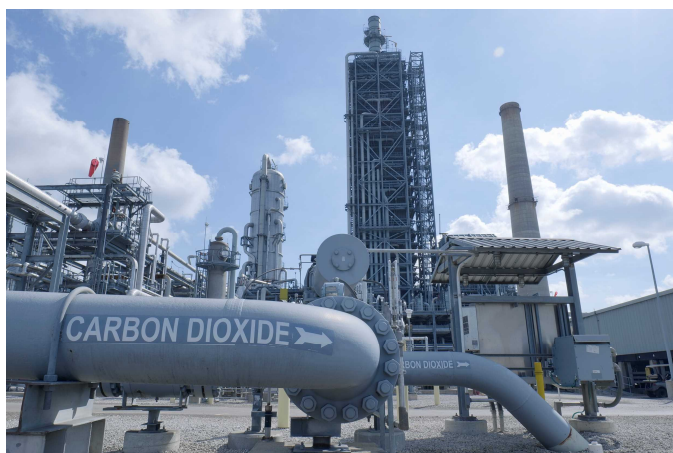
Petra Nova Carbon Capture Facility

<Note> CCUS stands for Carbon Dioxide Capture, Utilization and Storage. It is a technology that focuses on generating new commodities and energy in addition to capturing and storing CO 2 .